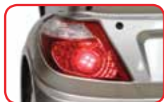
Rear LED Light Package