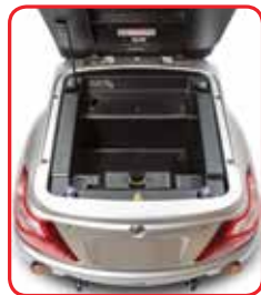
Under Seat Storage

Soar into Adventure with the all new Pride® Raptor! With speeds up to 14 mph and a 400 lb. weight capacity, it's the perfect scooter for anyone and everyone. Travel greater distances with a per charge range up to 31 miles and experience a smoother ride over varied terrain with front and rear suspension.