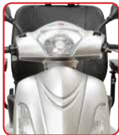
Front LED Light Package